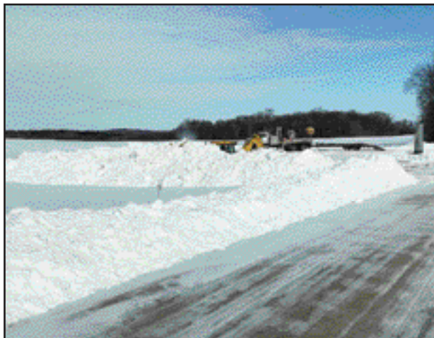
An exceptionally snowy winter necessitated clearing snow away from many locations before installing poles.