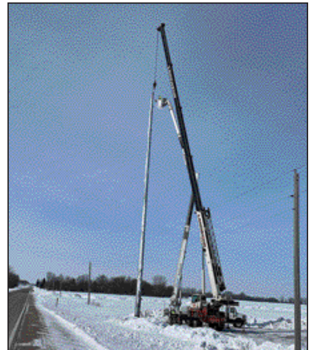
Stacking a total of 49 monopoles across the entire Co-op service territory provides fixed wireless service to members.