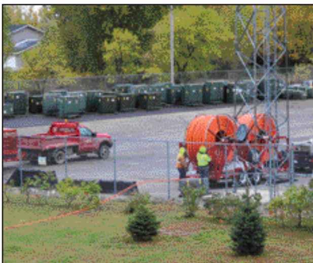
Day One of interduct installation, beginning at the Meeker Cooperative headquarters.