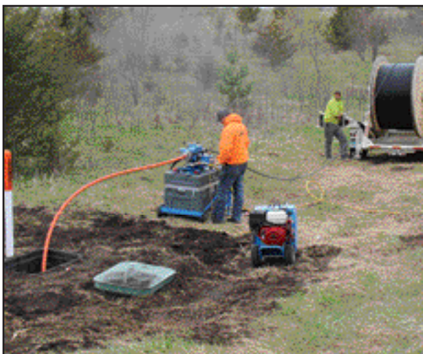
Once the orange interduct is installed, crews are able to “blow” fiber right into the protective sheath underground.